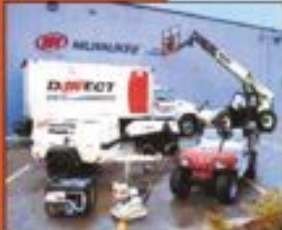
Factory Service Where You Need It When You Need It