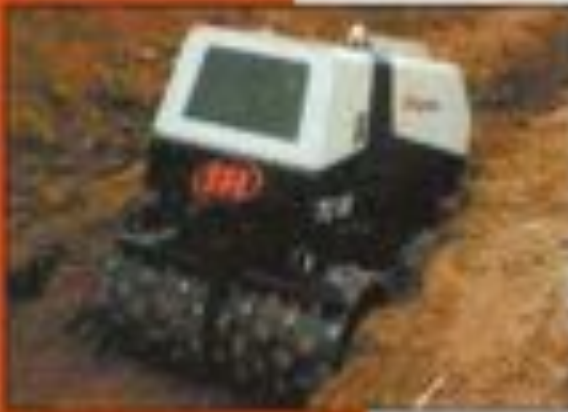
New TC13 Trench Compactor