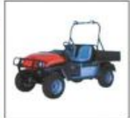
Pioneer 1200 Now Carrying Complete Line