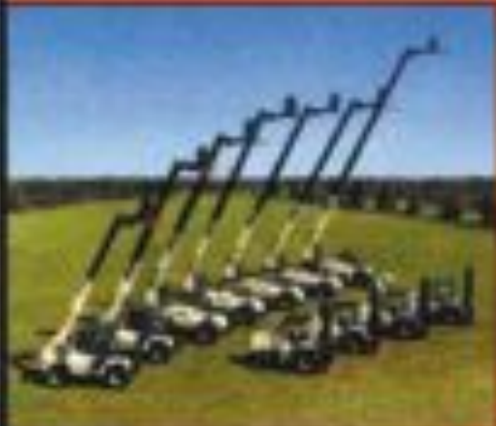
Forklift: Complete Inventory