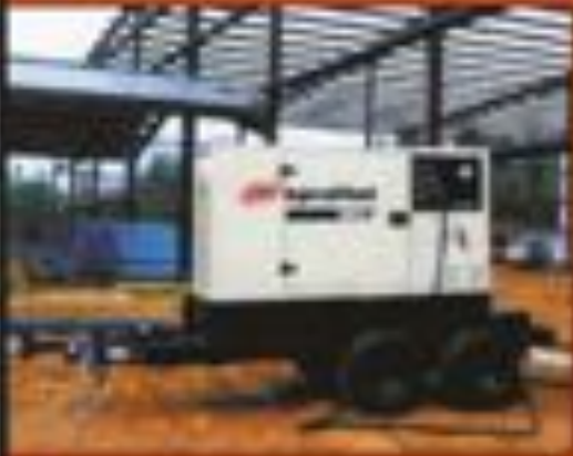
Generators from G20 to G575