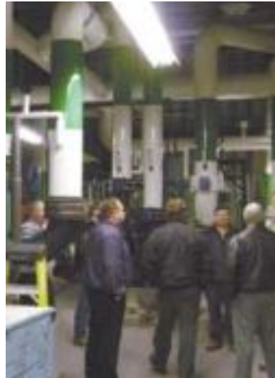
PFMA Canada members investigate the depths of the heating and cooling systems of Chatham-Kent Health Alliance's new St. Joseph's Hospital Wing during a tour on November 25th.