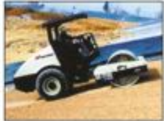
SD 77DX TF Series Small Compaction