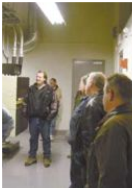
PFMA Canada members check out the control panels for the utility services for the Hospital.